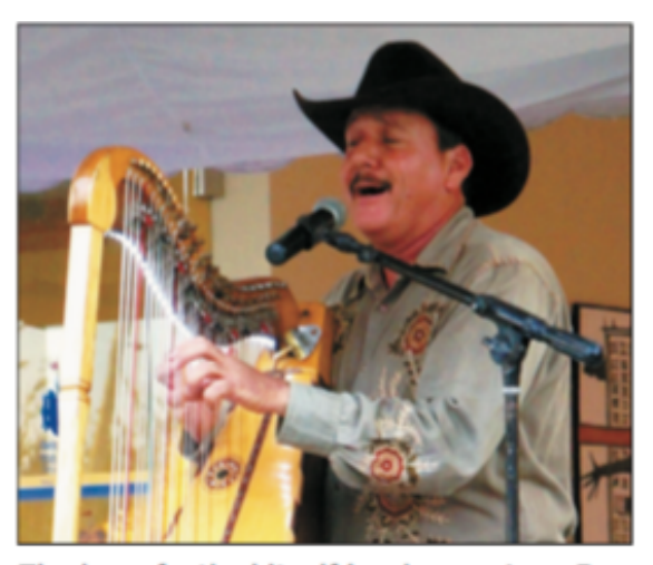
The harp festival itself begins on June 5.

You won't want to miss this very special show on Saturday , June 1 <sup>st</sup> at the Spotlight Club! Mariachi Femenil INNOVACIÓN MEXICANA de Tlaquepaque Jalisco. Go to <a href="https://youtu.be/uoFsjB7">https://youtu.be/uoFsjB7</a> K1I right now and catch a glimpse of this stunning group.