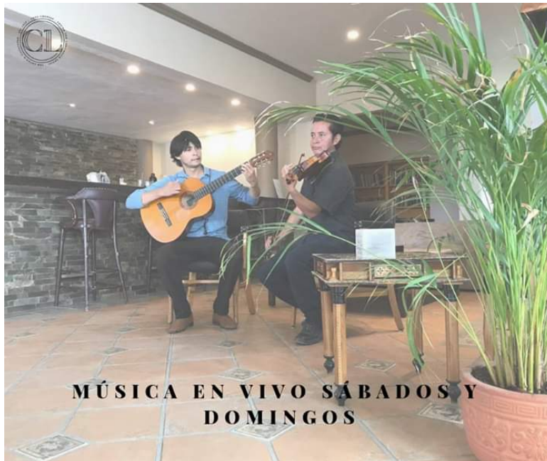
Tradicion All Chapala

For Saturdays and Sundays from 11 AM to Noon there is live music with Tradicion All Chapala at Casa Libertad (The CL) at Chulavista122 in San Antonio Tlayacapan. Phone (332) 026-3026 for more information or reservations.