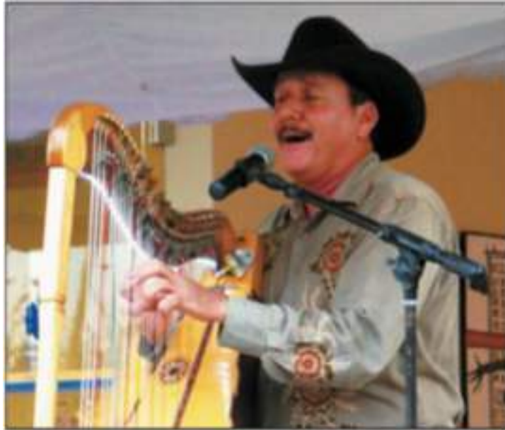
The harp festival itself begins on June 5.